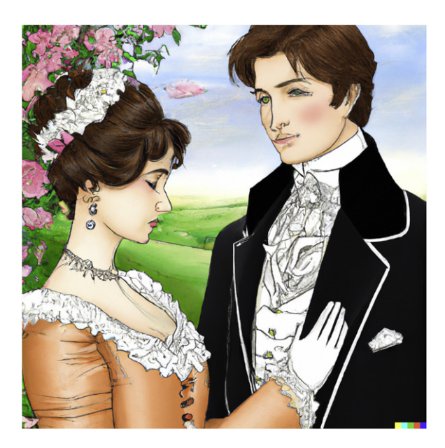
Fig. 3. Pride and Prejudice as Shojo Manga, by DALL-E and me.

to produce vlog adaptations of other classic works (like Emma , Frankenstein or Little Women), but they were not as popular.<sup>51</sup> One explanation could be that the Pride and Prejudice story is simply better suited to the online video format because of the focus on the heroine and the confessional style. But maybe it is simply that the timing is no longer right, and the media ecology has readjusted. That is, when TLBD launched in 2012, it still fitted within the existing vlog culture of YouTube, but this too has moved on. Nobody makes videos like this anymore. Now, audiences are used to the more fragmented and amateurish look and feel of TikTok videos, so the scripted monologues of Pemberley's adaptations are not fresh. They might still be an innovation compared to text or film adaptations, but our expectations as to the aesthetics of online video have shifted dramatically. Digital media aesthetics are evolving fast, and this degree of media convention instability might be one of the most poignant characteristics of adaptation in our time, where the known story is practically the only safe anchor, as we find our way through a maze of shifting platforms, modalities, framings and audience expectations.