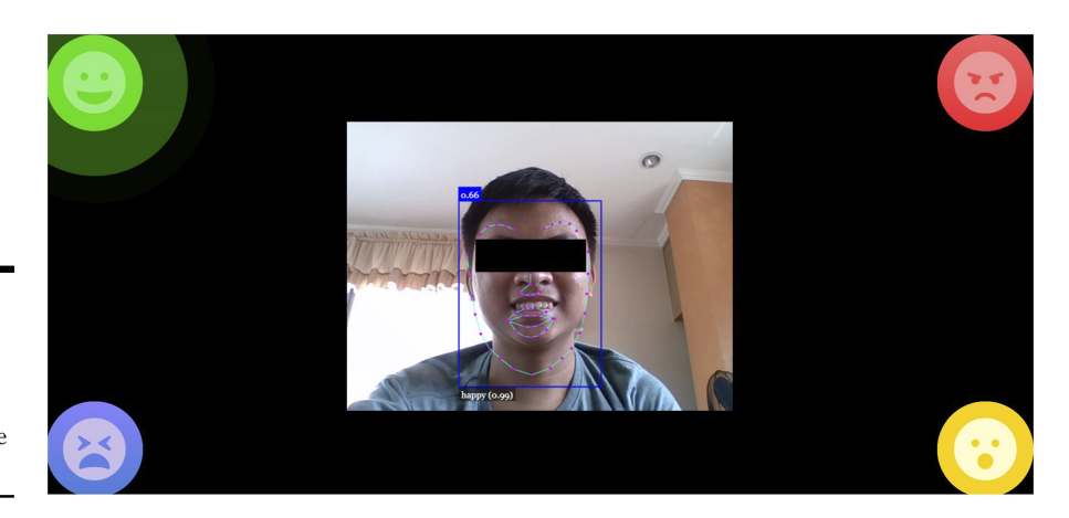
Figure 2. Mood-matrix interface prototype

fearful, the blue mood marker activates, representing the feeling of sadness or dread. Finally, the yellow mood marker signifies surprise or shock, and is activated when a person feels surprised or shocked. This simple system only scans one of the supported four basic emotions at the time. At the center of the screen is a live video feed of the patient's face taken from the camera. In the live feed, the patient's detected face is surrounded with a bounding box and the detected emotion is displayed below it along with the confidence score of the detected emotion. Above it is the confidence score of the face detection. All elements in the display are placed over a black background over a full-screen layout. The researchers tried different color backgrounds including white and found black to be better.