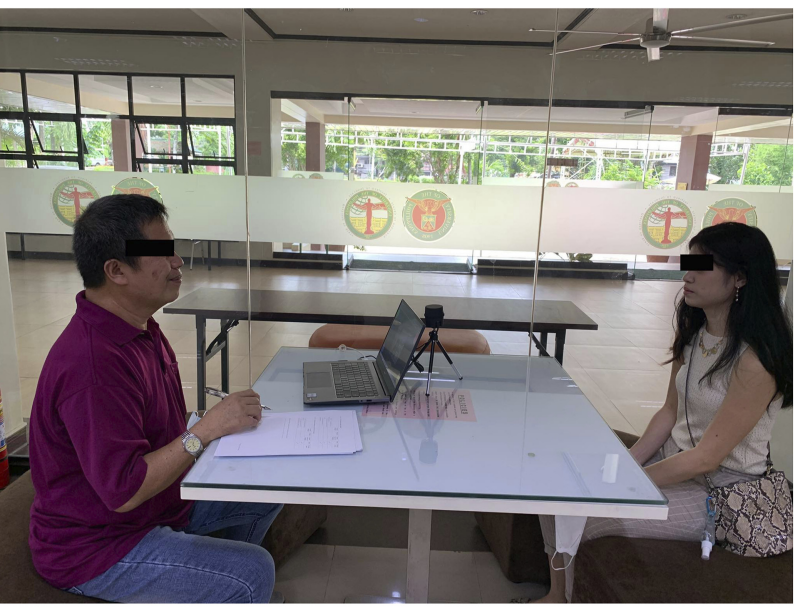
Figure 3. Testing setup: (1) A diagram layout of the testing setup. (2) Setup in the university library with a guidance counselor (left) and student-patient (right)