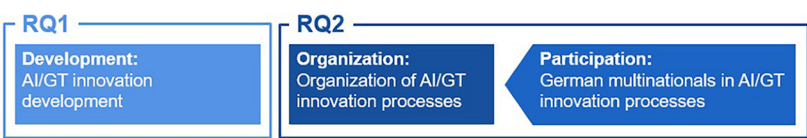
Figure 1. Research approach and sections of the interview guide

The interview data were analysed using a thematic qualitative text analysis, as outlined by Kuckartz (2014). Based on the research questions and theoretical considerations, the main