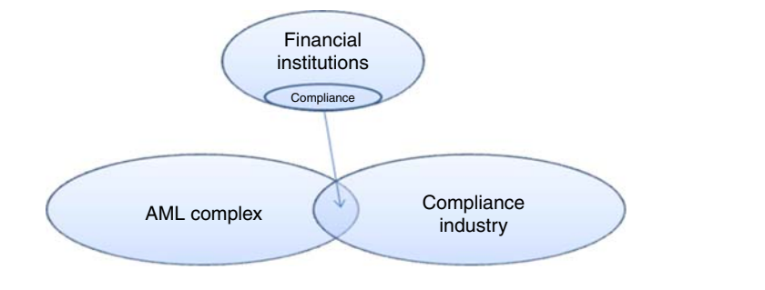
Figure 2. AML complexcompliance industry relations

The first study employed a multi-methodological approach (Ponsaers and Pauwels, 2002; Bijleveld, 2005), combining quantitative and qualitative measures. The first phase of empirical data gathering used a web survey as quantitative instrument, followed by a qualitative phase that included semi-structured interviews, open source and literature research and observations. The web survey was accessed by compliance officers in Belgium through an