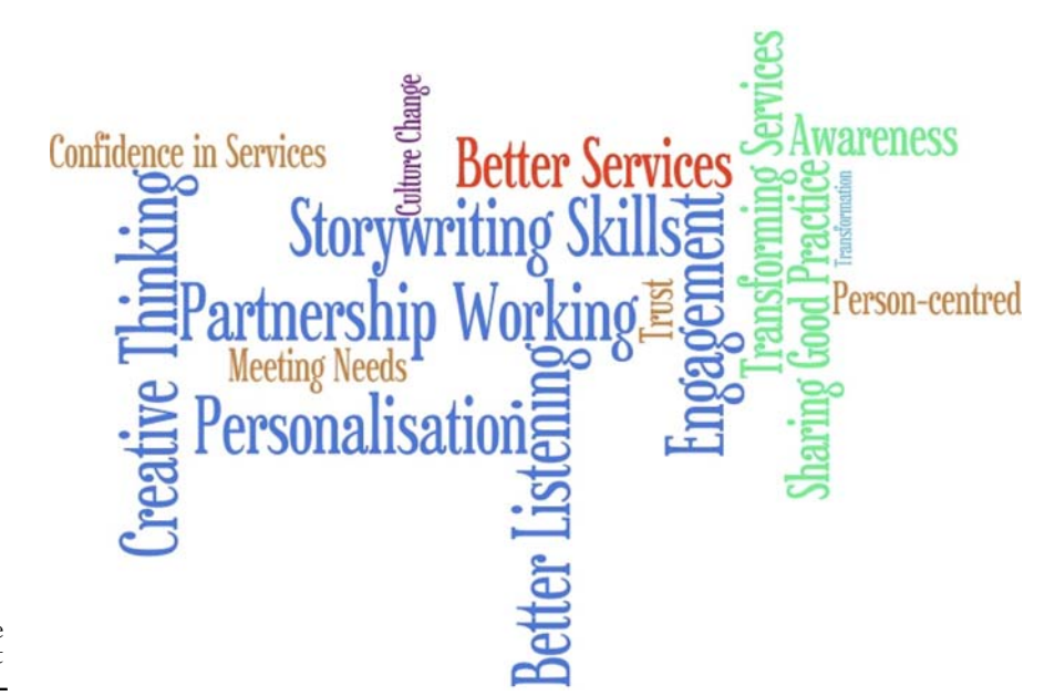
Figure 1. A wordle-analysis of the outcomes from the Social Care Co. project

This reflects the responsive design of evaluation in workplace learning projects. For example, on consideration, questions 2 to 4 in the evaluation framework are most