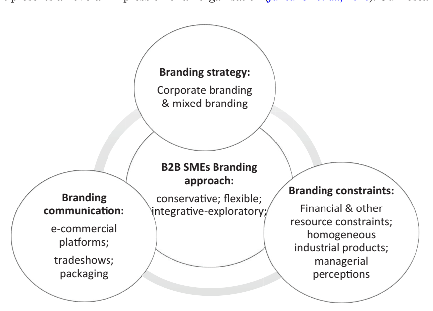
Figure 2. B2B SME branding framework

To guide such effort, it is worth reiterating the finding that corporate brand was the most popular and applicable branding strategy in this B2B study context. This finding echoes earlier studies showing that a corporate brand was a convenient branding strategy to apply, as it presents an overall impression of an organisation (Juntunen et al. , 2010). Our research